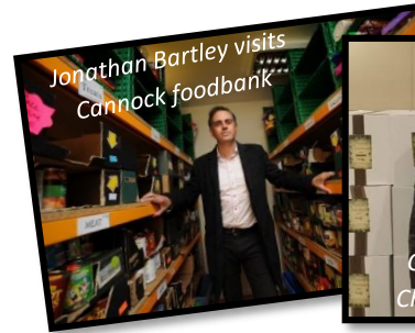
Jonathan Bartley visits Cannock foodbank