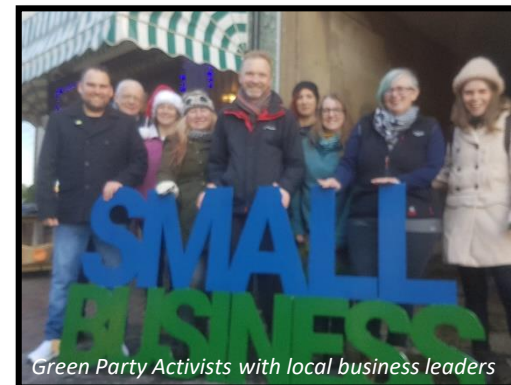
Green Party Activists with local business leaders

Other initiatives to help local businesses will be launched in the spring.